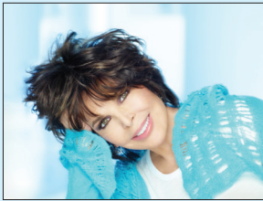
Carole Bayer Sager

Grammy and Academy Award-winning songwriter and now best-selling author of "They're Playing Our Song"